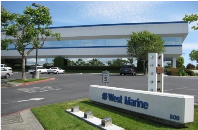
West Marine HQ, Santa Cruz, CA