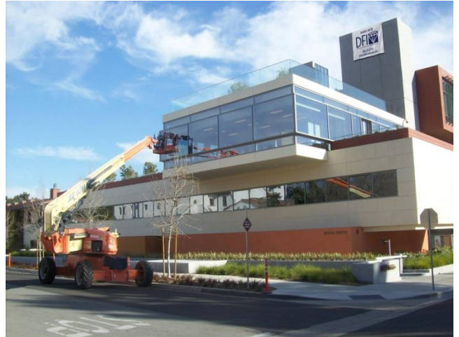
Claremont McKenna College, CA