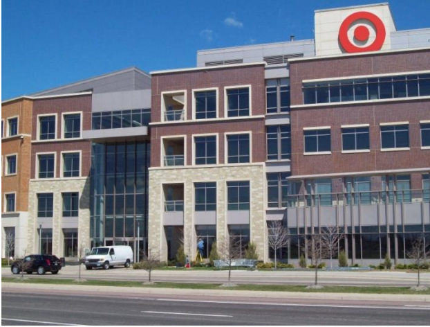
Target, HQ – Minneapolis, MN