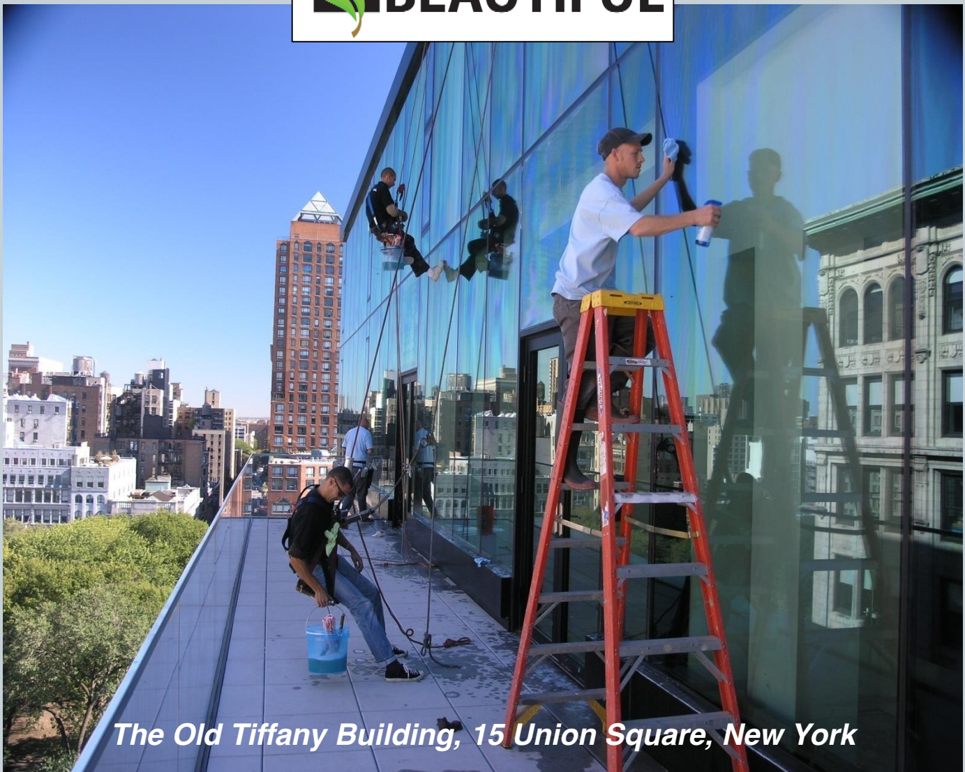
The Old Tiffany Building, 15 Union Square, New York