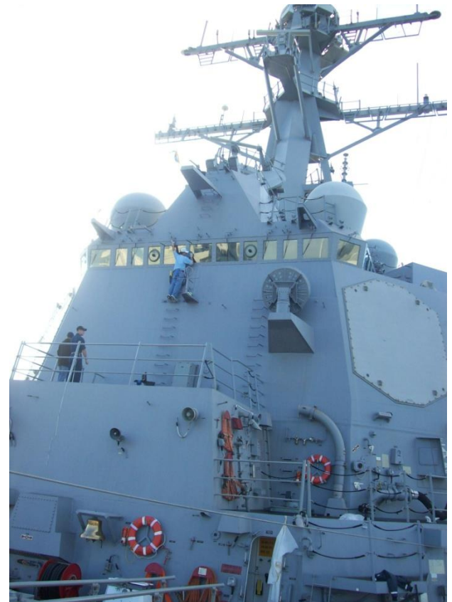
USS Halsey, US Navy