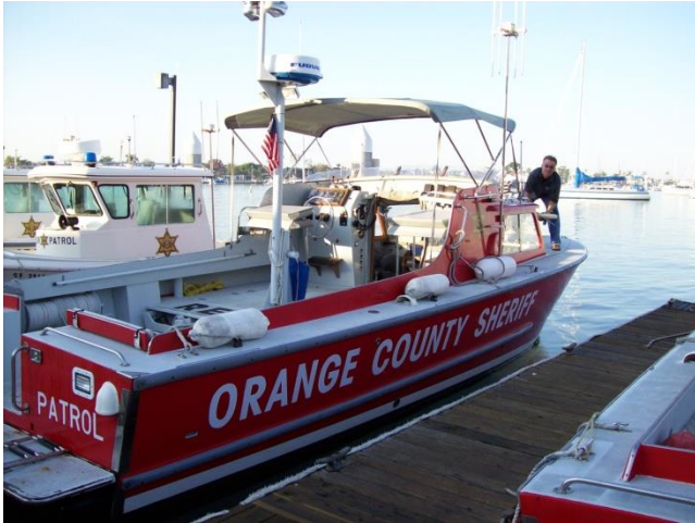
Orange County Sheriff Harbor Patrol