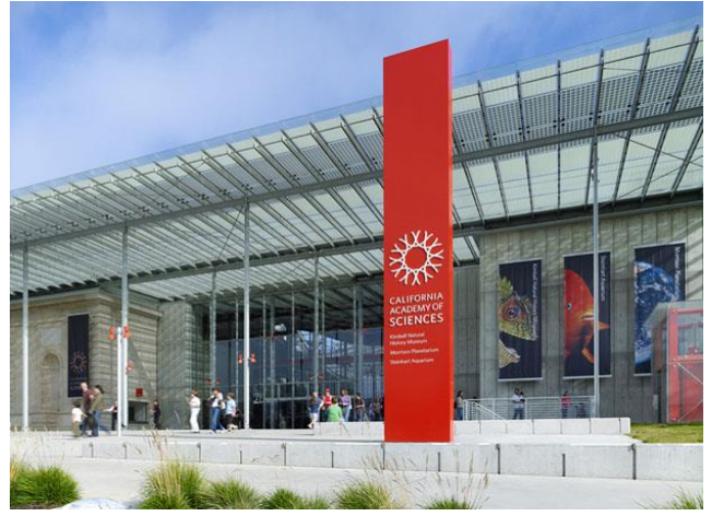
California Academy of Sciences, SF, CA