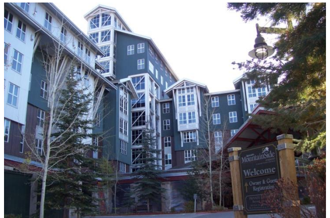
Marriott's MountainSide Resort, Park City, UT