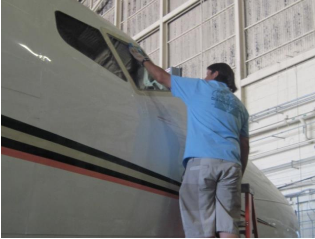
San Jose Sharks, NHL Team Charter Jet