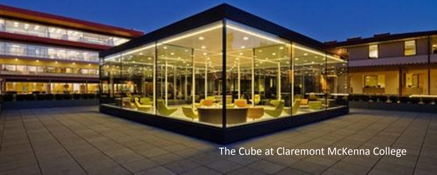
The Cube at Claremont McKenna College

"I am very impressed with DFI and looking to incorporate more Diamon-Fusion® coating projects across the campus... I have cut my window cleaning by 50% and saved $12,000-$14,000 per year since Diamon-Fusion® was applied to our windows."