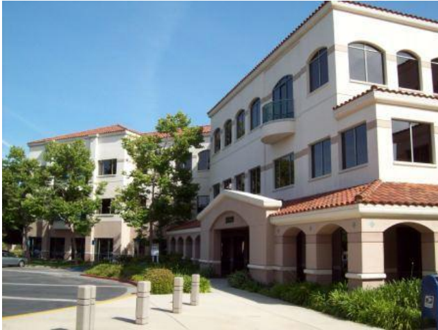
Pepperdine University, Los Angeles, CA