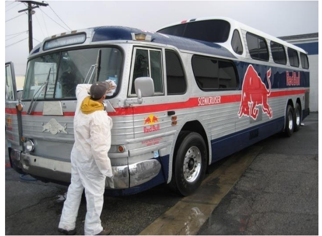
Red Bull Promotional Bus